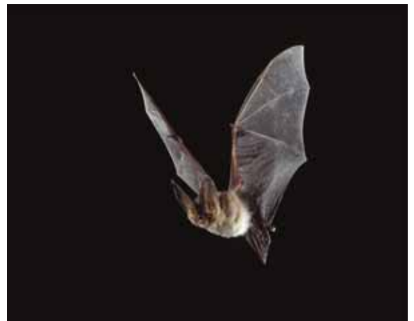
THE TOWNSEND'S BIG-EARED BAT is on the Kansas Species in Need of Conservation List. Its gigantic ears are useful in its ability to detect flying moths by its echolocation ability. Donating to the Chickadee Checkoff program on your Kansas Form K-40 helps these and many more beneficial Kansas animals.